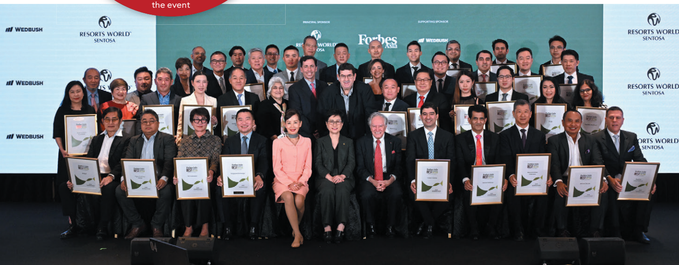
Award recipients, Speakers, Sponsors and Forbes executives at the event

Each year, the Best Under A Billion list spotlights 200 top-performing publicly listed companies in the Asia-Pacific region with annual sales under US$1 billion. From a universe of over 19,000 small and mid-sized companies, these 200 Best Under A Billion companies have track records of exceptional corporate performance. Using both quantitative and qualitative metrics, the final list of 200 is truly a select group.