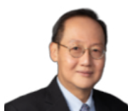
Dr Tan See Leng Minister for Manpower and Second Minister for Trade and Industry