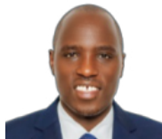
Hon. Dr Doto Mashaka Biteko (MP) Deputy Prime Minister and Minister for Energy, United Republic of Tanzania