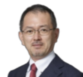
Masanori Tsuruda Deputy Commissioner for International Affairs, Agency for Natural Resources & Energy, ME Japan